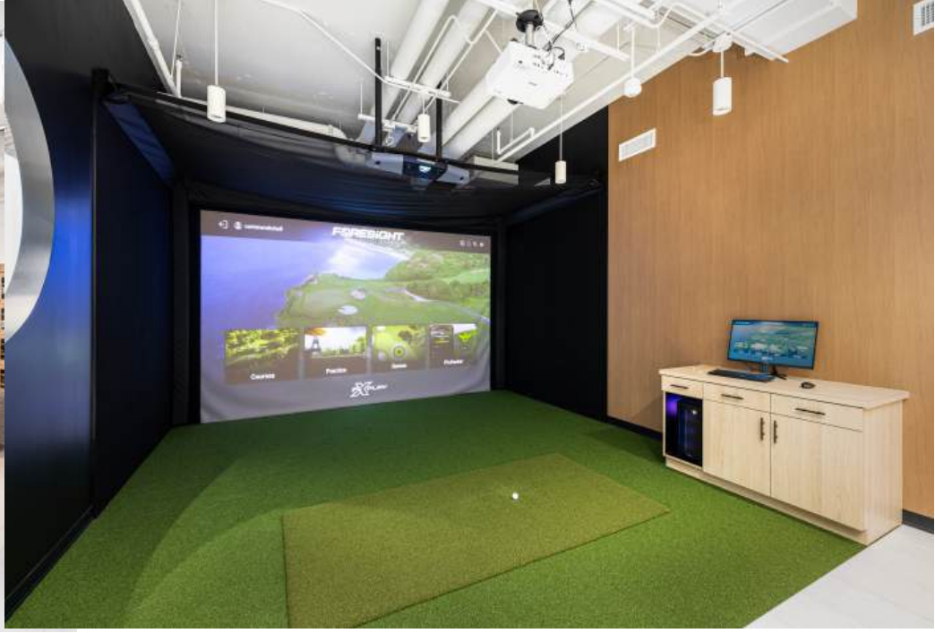
NEW TENANT LOUNGE – GOLF SIMULATOR – CONFERENCE CENTER – ON SITE MANAGEMENT